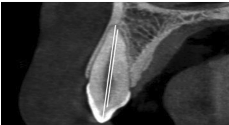
Fig. 2 Pulp to tooth length ratio

The t test was used to compare the mean variables between males and females. Table 2 presents the results. As shown in Table 2, no significant difference was found between males and females regarding the measured variables ( P > 0.05 ). Since the values of all variables were the same in males and females, and also the correlation pattern between these variables and age was the same in males and females, the multiple linear regression was used for age estimation according to the measured variables.