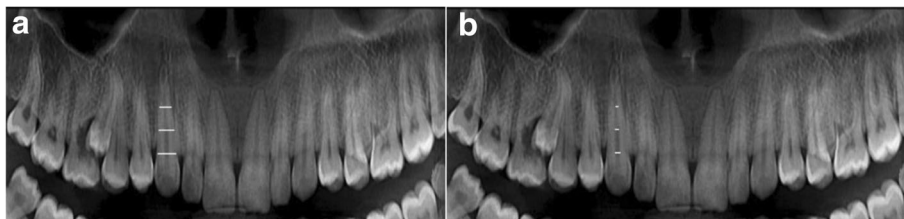
Fig. 4 a, b Pulp/root width ratio at cemento-enamel junction level and mid-root level and midpoint between the cemento-enamel junction and the mid-root in panoramic-like image

Maxillary canine teeth were used in this study because they are single-rooted and have a single canal as well as